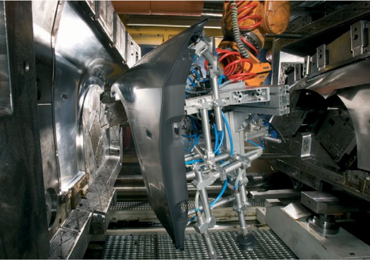
In the Landshut plant, components for many BMW vehicle types are produced