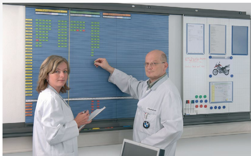
With a DYNA Planning Board, the manufacturing methodologist keeps an overview of the status of his projects.

In parallel with the shift planner in the foreman areas, the DYNA Planning Board System is also used as a planning aid for the organization of processes, resources and tools for painting projects. Here, the header of the planning board represents the painting lines available. The projects to be worked off are assigned to the